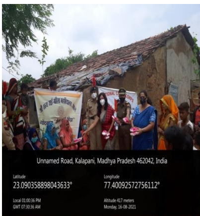
Unnamed Road, Kalapani, Madhya Pradesh 462042, India

Latitude 23.090358898043633° Local 01:00:36 PM GMT 07:30:36 AM