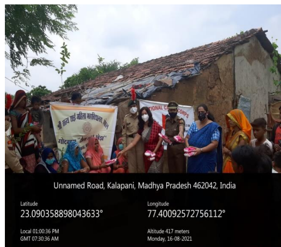
Unnamed Road, Kalapani, Madhya Pradesh 462042, India

Longitude 77.4011185951531° Altitude 410 meters Monday, 16-08-2021