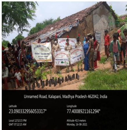
Unnamed Road, Kalapani, Madhya Pradesh 462042, India

Longitude 77.40092572756112° Altitude 417 meters Monday, 16-08-2021