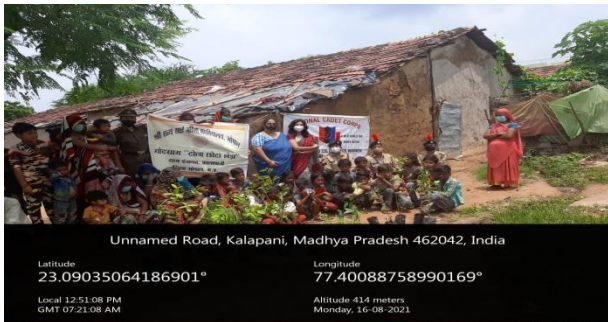
Unnamed Road, Kalapani, Madhya Pradesh 462042, India

Latitude 23.09035064186901° Local 12:51:08 PM GMT 07:21:08 AM