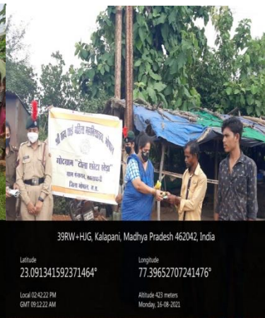
39RW+HUG, Kalapani, Madhya Pradesh 462042, India

Longitude 77.4008921161294° Altitude 413 meters Monday, 16-08-2021