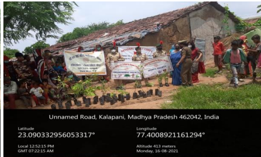
Unnamed Road, Kalapani, Madhya Pradesh 462042, India

Longitude 77.40088758990169° Altitude 414 meters Monday, 16-08-2021